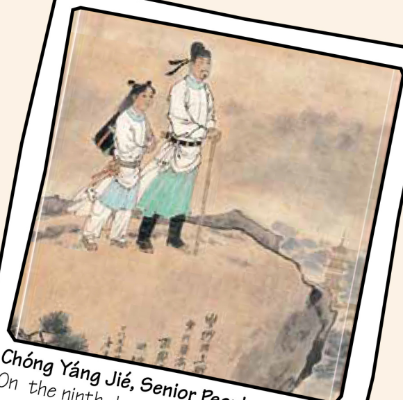
Chóng Yǎng Jié, Senior Peoples' Day: On the ninth day of the ninth lunar month, people go to see the chrysanthemums bloom and climb or hike to the top of hills or mountains.