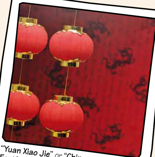
"Yuan Xiao Jie" or "Chinese Lantern Festival" is celebrated on the 15th day of the first lunar month. It marks the end of the series of celebrations starting from the Chinese New Year.