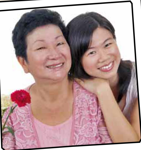
Fù Nǚ Jié, Women's Day: On 8th March Chinese people celebrate women's contributions to society.