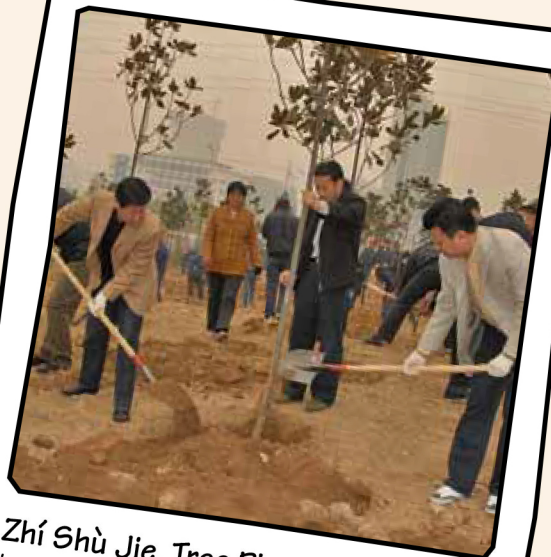
Zhí Shù Jié, Tree Planting Day is on 12th of March; on this day Chinese people plant trees to protect their environment.