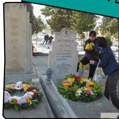
Qīng Míng Jié, Tomb Sweeping Day: On the 5th of April, people go clean their ancestors' tomb to pay their respect.