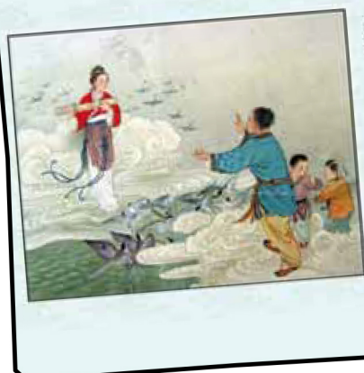
Qī xī, Chinese Valentine's Day: On the seventh day of the seventh lunar month of the traditional Chinese year Valentine's Day is celebrated.