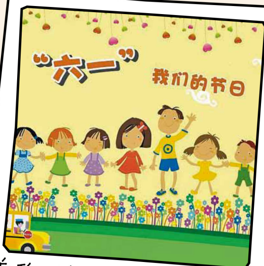
Èr Tóng Jié, Children's Day: On the 1st of June, Chinese celebrate this day for kids. Kids are given gifts or taken to places like zoos or carnivals.