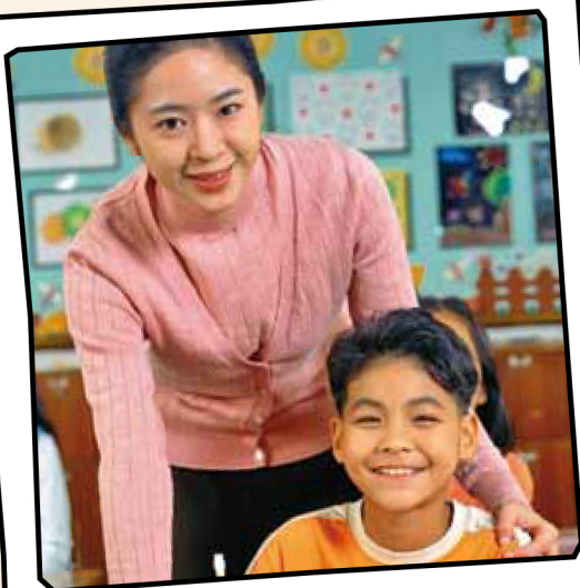
Jiào Shī Jié, Teacher's Day: On the 10th of September, teachers usually receive gifts from their students for their years of hard work.