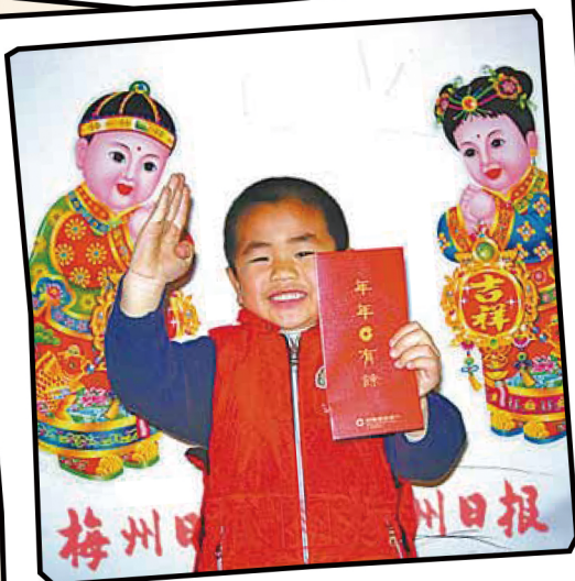
Yā suì qián , is a gift of money given by parents and older relatives to children as a symbol of protection.

Chūn Jié , the Chinese Spring Festival starts at mid night on the 30th day of the 12th month of the lunar calendar and ends on the 15th day of the 1st month in lunar calendar.