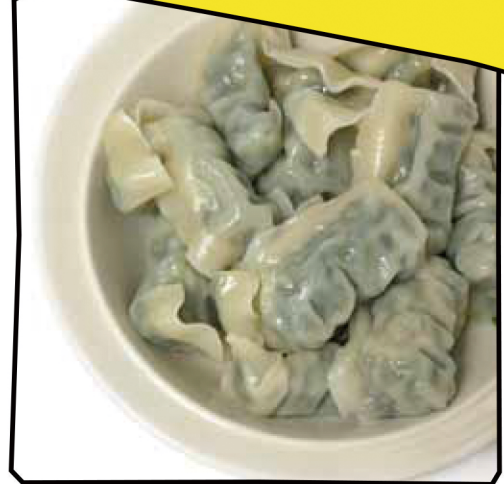
Jiǎo zi , the traditional food for the Chinese Spring Festival.