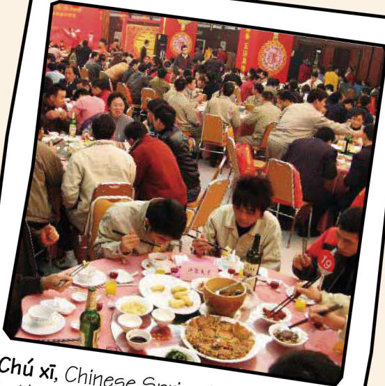
Chú xī , Chinese Spring Festival Eve, is the day on which family members all get together to celebrate the new year.