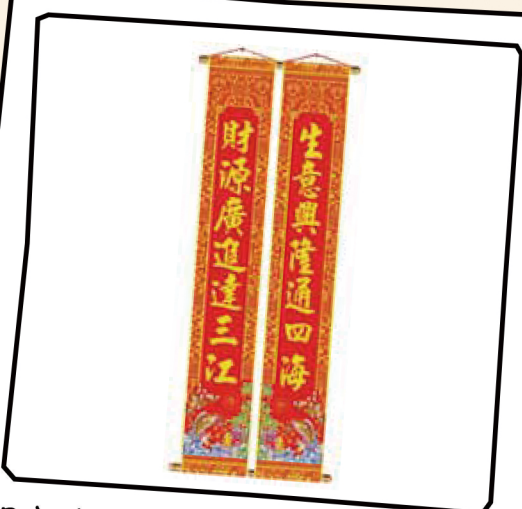
Duì lián , Spring Festival couplets, are usually written on two pieces of red paper and stuck to the door; they carry wishes for the coming year.