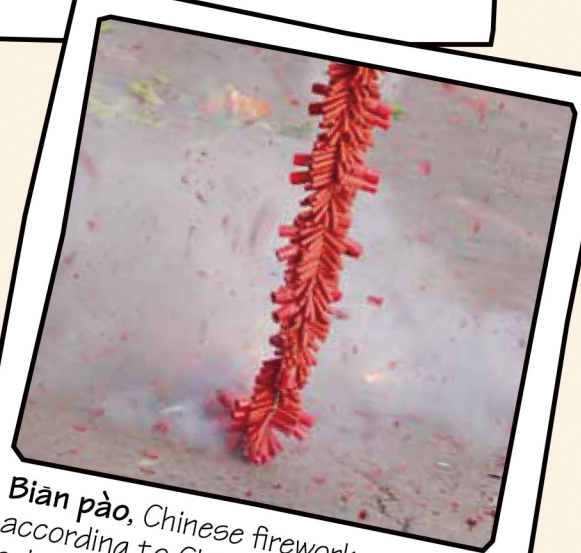
Biān pào , Chinese fireworks, according to Chinese legend, the colour red, loud sounds and the noise and fire of Chinese fireworks can scare away the Nian monster and keep people safe.