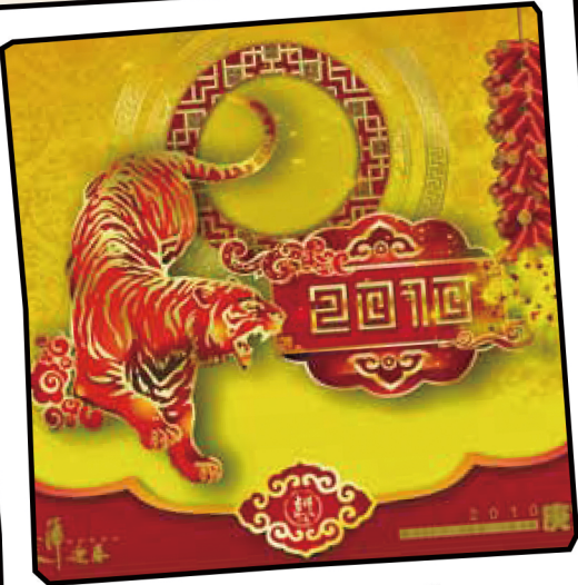
Hú nián , the Year of the Tiger, Chinese people use a cycle of 12 animals to represent different years. This year is the Year of the Tiger.